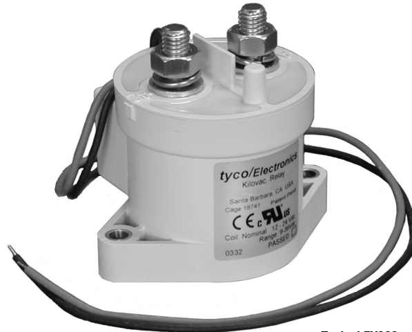
EV200 Series Contactor (CZONKA® Relay, Type III)

Typical EV200 applications include battery switching and back-up, DC voltage power control, circuit protection and safety.